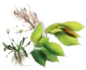
Grass clippings, weeds, leaves, tree branches, twigs, & roots