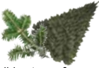
Holiday trees & greens (4 ft. long, bundled, no flocking/decorations)