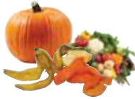
Fruit & vegetable scraps; leftovers; pumpkins