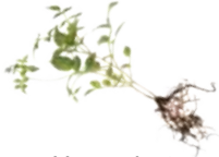
Houseplants (no pots)