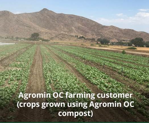
Agromin OC farming customer (crops grown using Agromin OC compost)