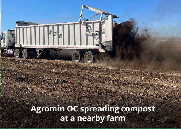
Agromin OC spreading compost at a nearby farm