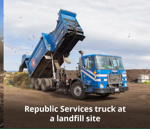
Republic Services truck at a landfill site

As a direct service provider, Republic Services not only produces the organic compost farmers need for more sustainable farming, but we also transport it to farms, while providing jurisdictions with the documentation and reporting they require by law.